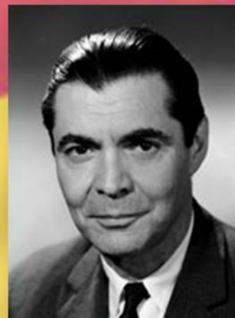
George Emil PALADE